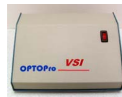
Optional VSI Controller with long-travel, Closed- Loop Piezo Actuator