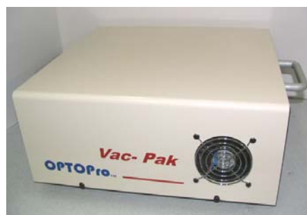
Vacuum Source & Shutter Control