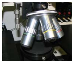
Optional 4-Position Objective Lens Turret